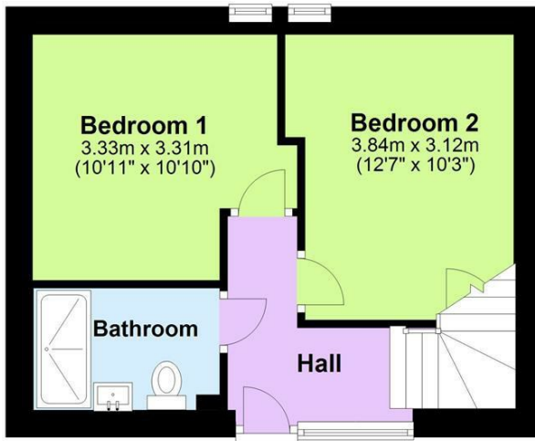
Ground Floor Approx. 33.6 sq. metres (362.2 sq. feet)